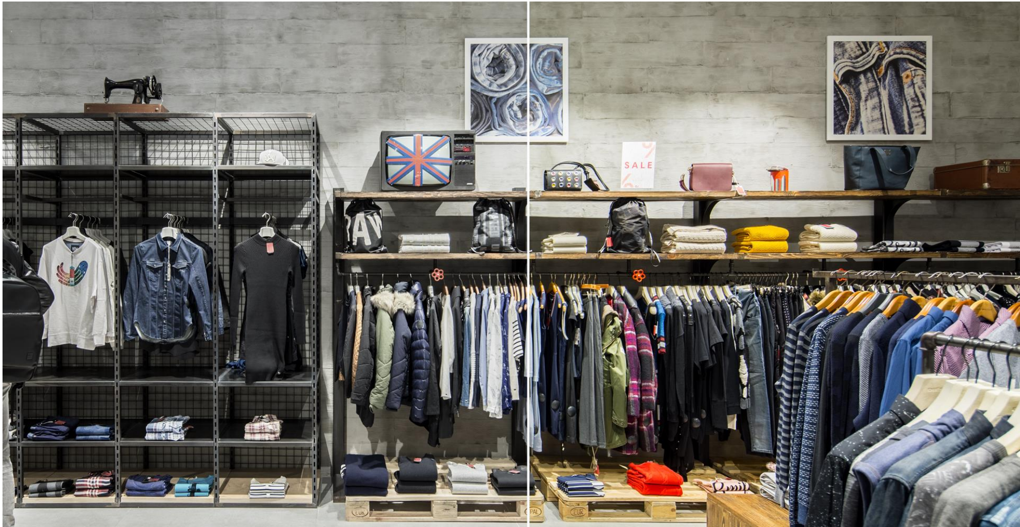
CRI 70 Ra

We use light sources with high color rendering