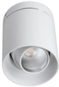
Surface mount lights